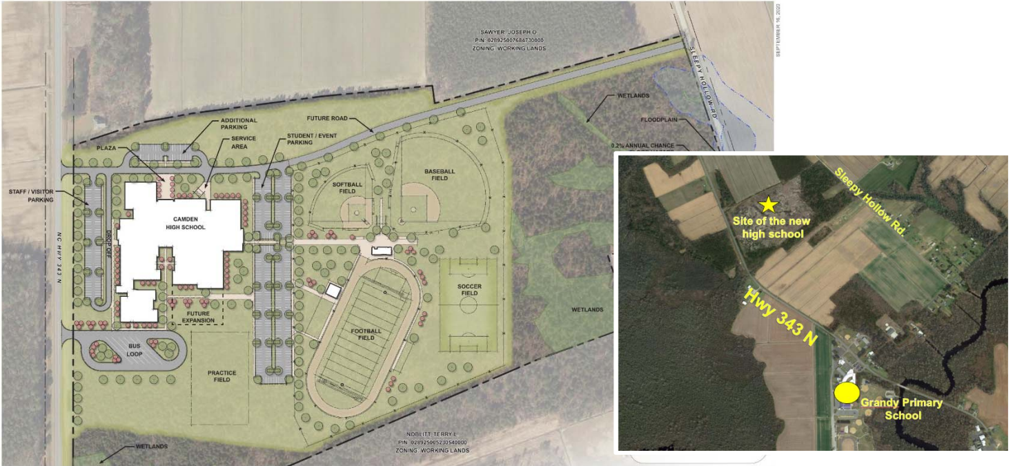
CAMDEN HIGH SCHOOL CONCEPTUAL SITE PLAN

Election day is Tuesday, November 3, 2020